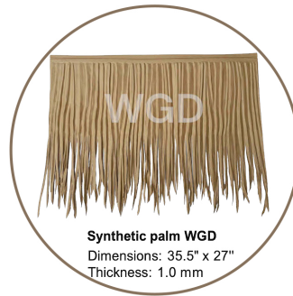
Synthetic palm WGD Dimensions: 35.5" x 27" Thickness: 1.0 mm