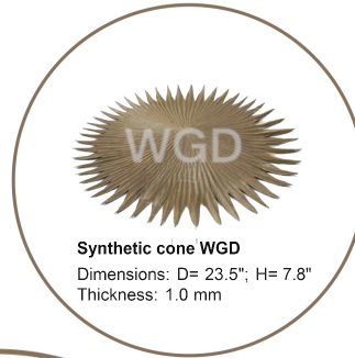
Synthetic cone WGD Dimensions: D= 23.5"; H= 7.8" Thickness: 1.0 mm