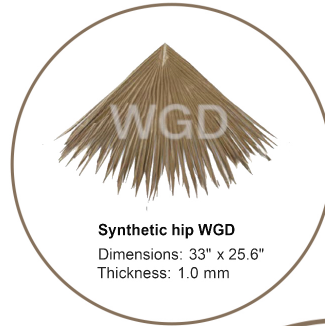
Synthetic hip WGD Dimensions: 33" x 25.6" Thickness: 1.0 mm