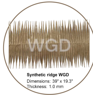
Synthetic ridge WGD Dimensions: 39" x 19.3" Thickness: 1.0 mm